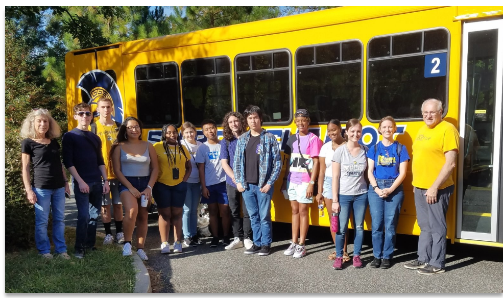
New STAMPS Scholars

This year's STAMPS scholars visited the National Zoo and its Smithsonian Conservation Biology Institute Science Building in late September. The scholars also explored the National Mall and museums in Washington DC.