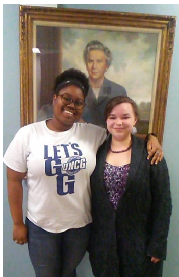
(Last PAL with current CA)